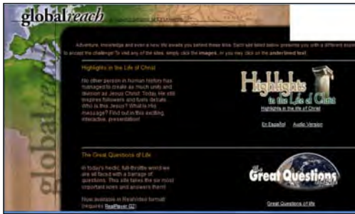
GLOBALreach.org as it appeared in 1998 with two languages online! Now we have 33 languages and over 7500 resources!